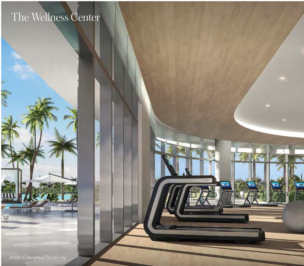
The Wellness Center